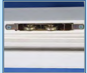
Standard tandem rollers on stainless steel track