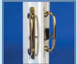
Optional brass hardware