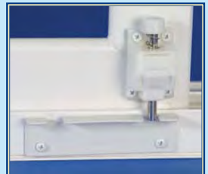
Optional Security Kick Lock.