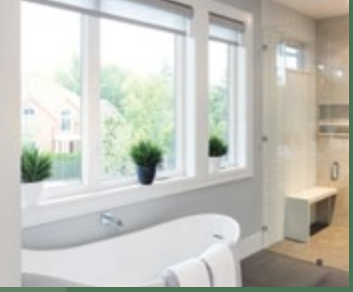
THE CASEMENT WINDOW